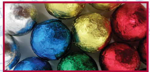
CHOCOLATE FOILED MARBLES